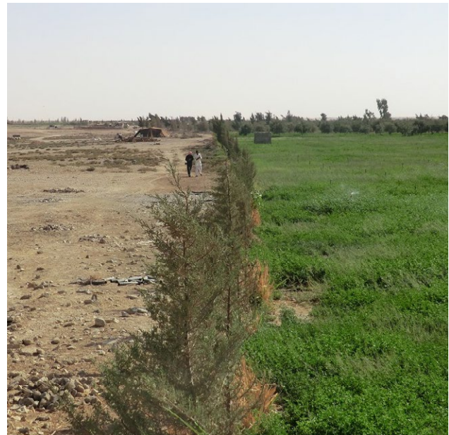
Figure 2: How lack of access to water contributes to degradation of dryland: on the left, Alfalfa irrigated with sprinkler, on the right dry land in Azraq, Jordan.

Land degradation and conflict are deeply intertwined, especially in fragile countries. Land degradation fuels conflict. Conflict accelerates land degradation and jeopardizes the capacity of States and communities to engage and invest in land degradation neutrality. At times, land degradation is the manifestation of deeper root causes of conflict. In the presence of root causes of