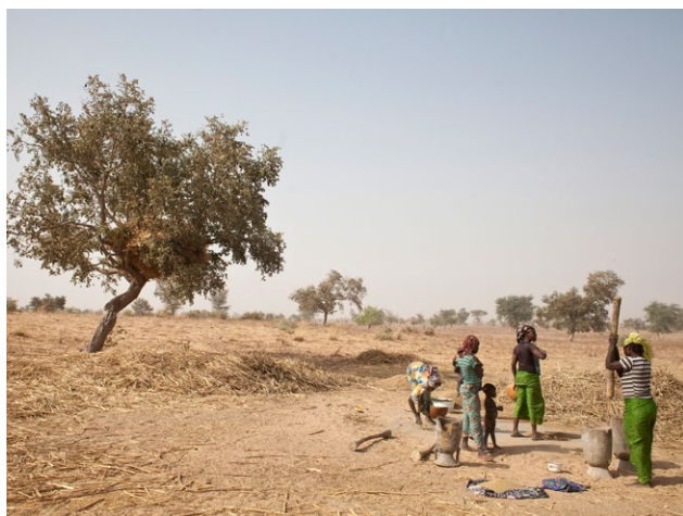
Figure 3: Women grinding and millet seeds in Niger.

Enhancing access to justice and strengthening multiple disputes resolution mechanisms that may co-exist on the ground can mitigate land-related conflicts and address some of the causes of land degradation. These include the lack of investment in sustainable land-use practices, the reluctance to invest in land restoration and land degradation neutrality actions, and the cutting of trees.