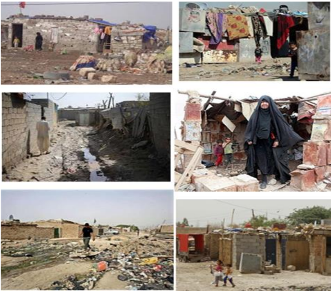
Figure 1: Shows the output of the housing shortage in Iraqi urban areas

As literature sheds light on what gives the impression to the real situation of the existing system in Iraq and all these external and internal challenges that it deals with within a present critical period to adequate and meet up with the urgent housing targets of user's needs. As literature sheds light that there are indications that key players involved primarily with LRCS problems are somewhat unlinked with the lack of CRT. In practice, these additional laws had also provided for local incomes including a real estate tax. It is crucial to mention here that the general negative influence has resulted from a series of external factors such as these wars of 1980, 1991 and 2003. However, the Iraqi LRCS constructionism issued a set of legal managements for registration of real estate and all provided additional procedures and gave additional protections to the end-users' rights and then CRT legatees. In practice, the responsibilities are well carried out by the LRCS aspects at the Iraqi legal level.