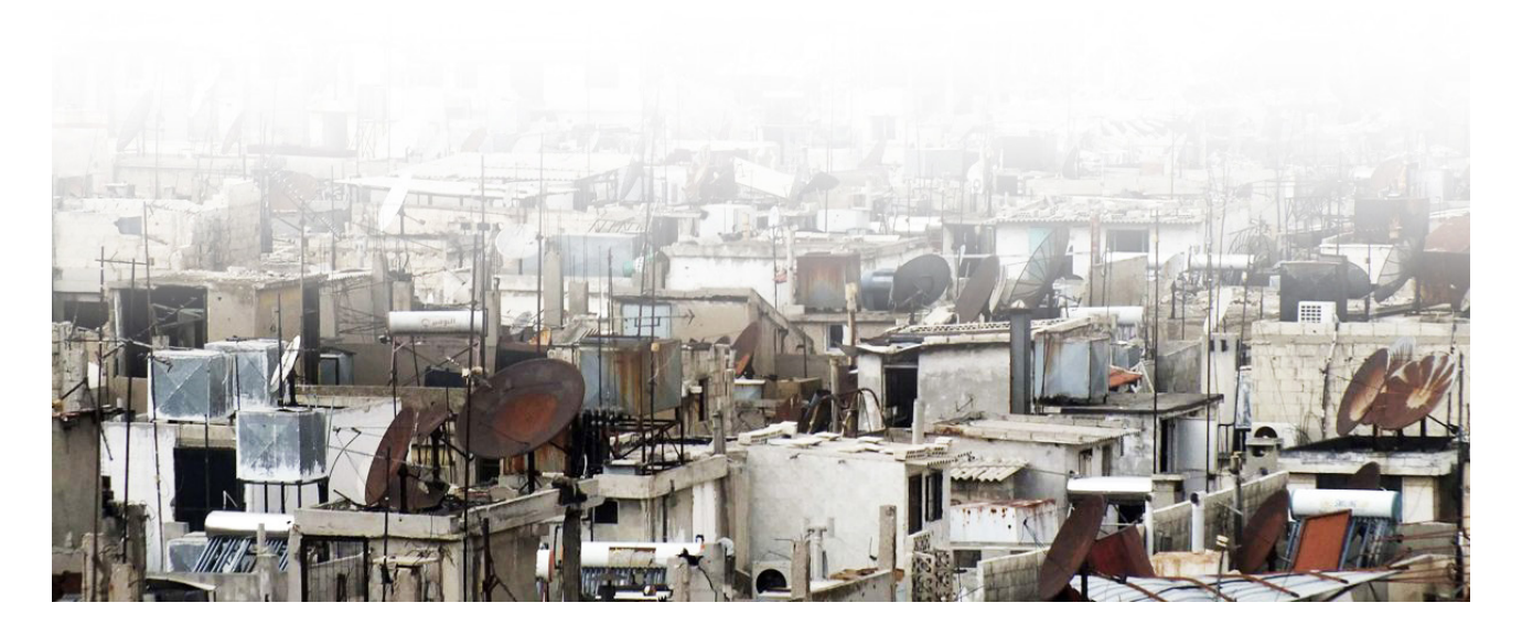
64 Britannica, The Editors of Encyclopedia. "Urban renewal." Encyclopedia Britannica, 25 May. 2017, https://www.britannica.com/topic/urban-renewal.

By this method the municipality could pool the individual properties in the informal area into one common property and redistribute parcels to rightsholders following development works while retaining the right to transfer some of the land for profitable uses (e.g., the construction of infrastructure and public spaces) and