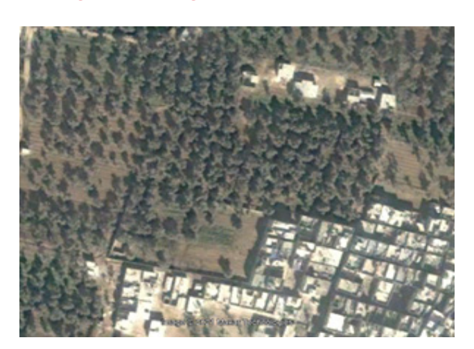
Figure 1: Illegal construction boom during the uprising of 2011 and 2012

Informal constructions were more tightly controlled from 2008 until the beginning of the protests arising in March 2011. When demonstrations began, informal developers took advantage of public authorities' preoccupation with the civil unrest to put up new buildings and raise the height of existing ones (see Figure 1 below of satellite images demonstrating the acceleration of informal urbanisation in this period). This informal "building boom" was further facilitated by the State's apparent appeasement policy towards public discontent in such communities which included a conciliatory posture towards building violations.26 However, as demonstrations shifted to armed conflict in 2012, many informal peri-urban areas became sites of active violence and were razed upon State reacquisition.